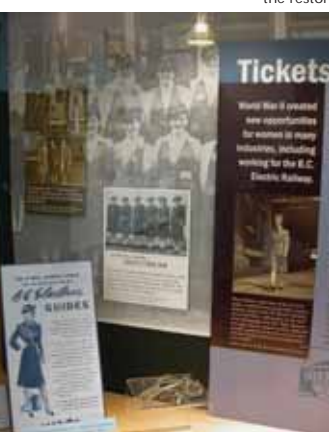
Tickets Please! display tells the story of women who worked for the B.C.E.R. during WWII.