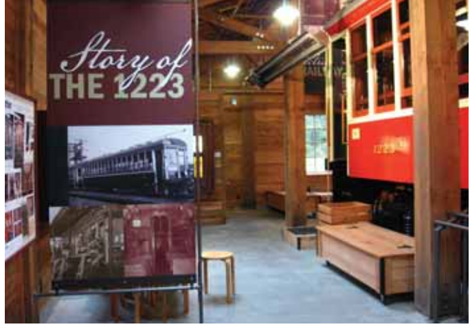
Inside the new Tram Barn exhibit.