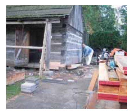
Log cabin deck and floor repair.

I want to live in this town! Very well done, everyone friendly and informative. Guest Comment Book, December 7