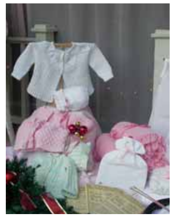
Bell's Dry Goods window.