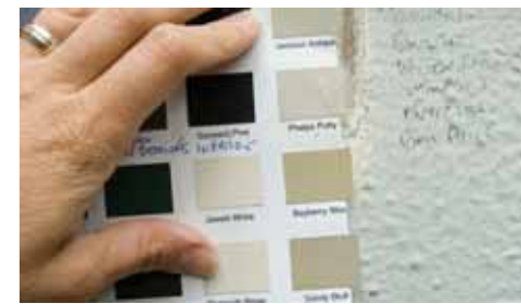
Elworth exterior paint history research.