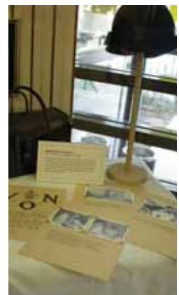
Victorian Order of Nurses display at the Kingsway Library.

Great info and not too imposing. I liked the relaxed approach.