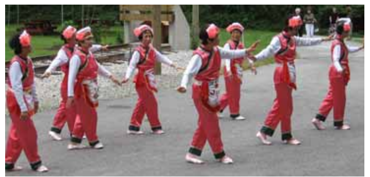
The North Burnaby Retired Chinese Dancers perform at the Multicultural Festival.