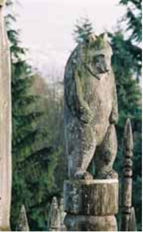
Playground of the Gods: before surface cleaning.