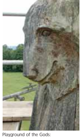
Playground of the Gods: after surface cleaning.