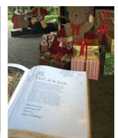
The Nutcracker is brought to life for a Storybook Christmas.