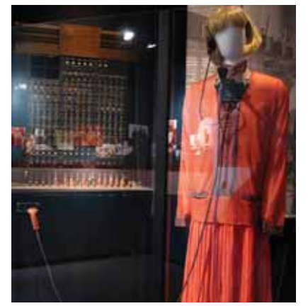
Women at Work exhibit features a 1920s telephone operator.