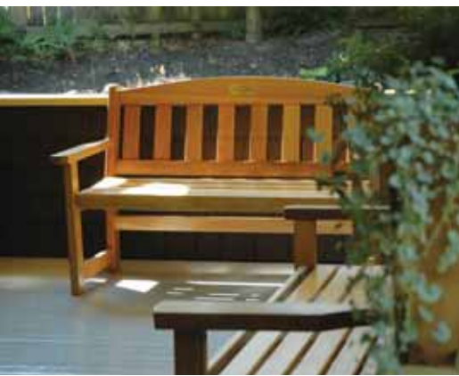
Benches and planters donated by the Burnaby Rhododendron and Garden Society