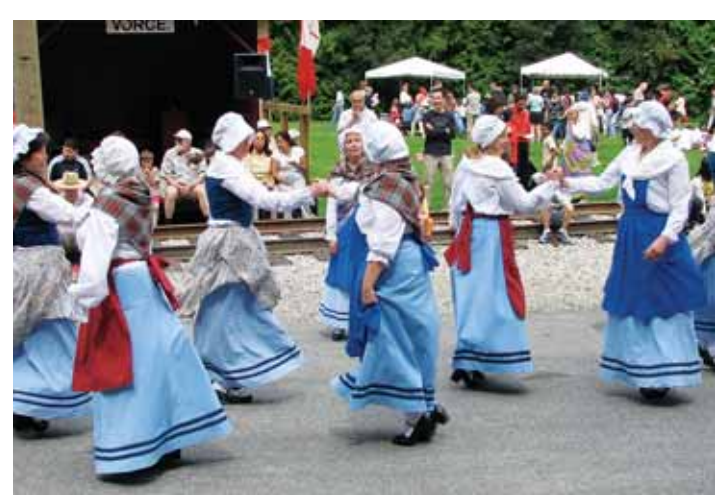
French-Canadian dance by Burnaby International Folk Dancers, Multicultural Day.