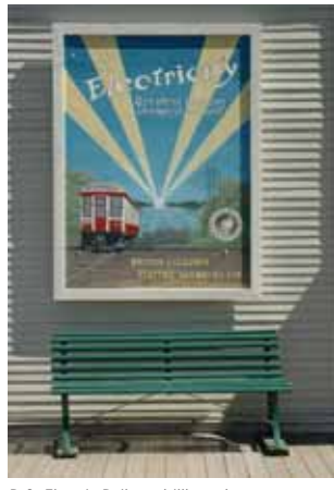
B.C. Electric Railway billboard.